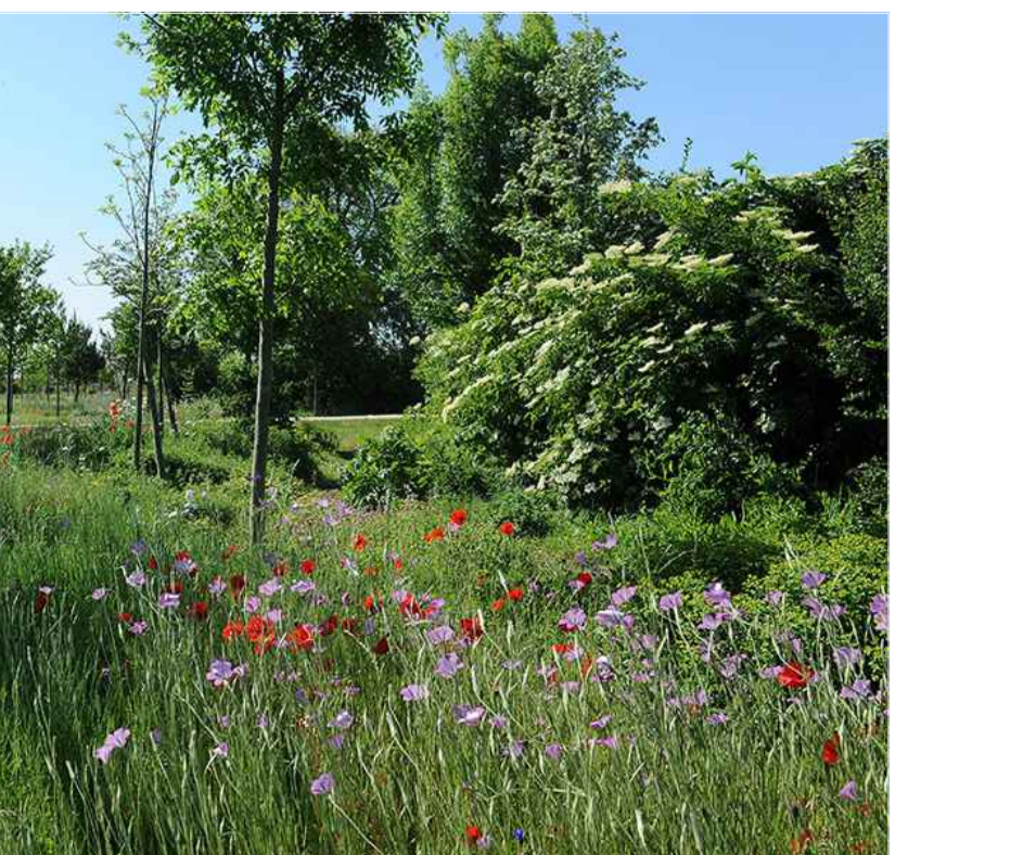
Native Planting to Biodiversity Corridor