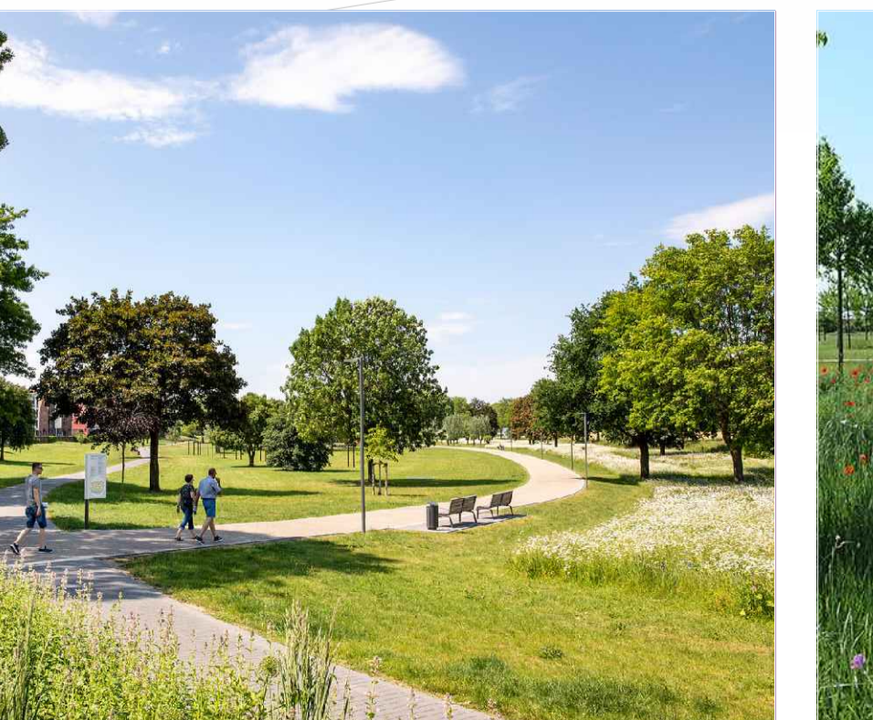
Grassed Areas for Passive Recreation